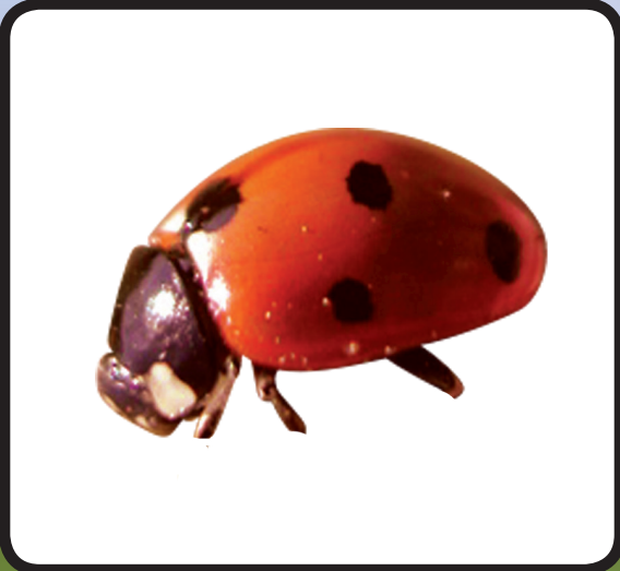
California's Unlikely Warriors