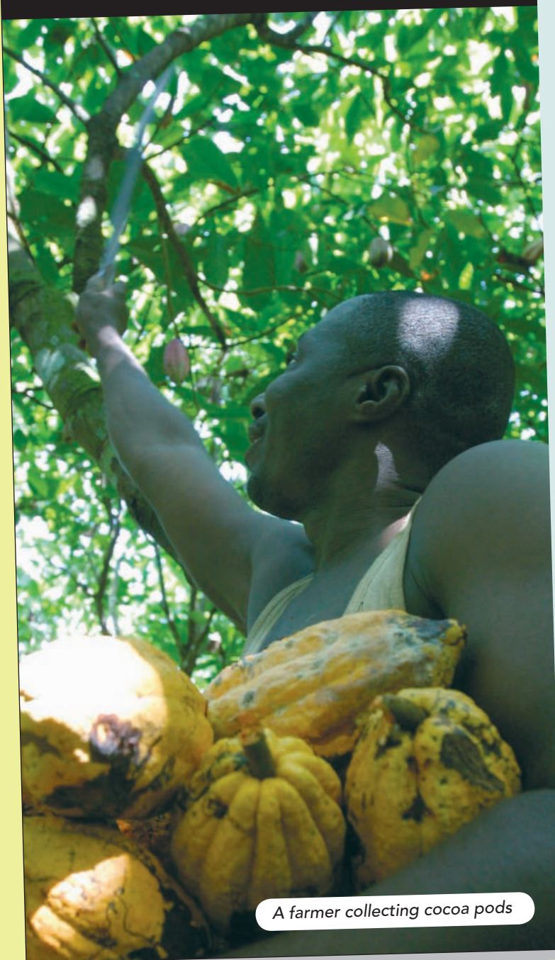
A farmer collecting cocoa pods