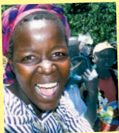
Children in Lucy's village

The extra money that these farmers now earn has helped transform completely the lives of people in the whole community. Their situation has been dramatically improved and they can finally take control of their own lives. Lucy explains: 'In our village, we decided to build a brand new well, so at long last we have our very own supply of clean water. Now my children can even go to school. It makes all the hard work worthwhile.'